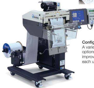
Configuration Options A variety of integration options are available to improve productivity for each unique application