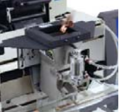
Simple Count Funnel Accumulating funnel option speeds productivity for hand load operations by automatically cycling bagger when a pre-set count is reached